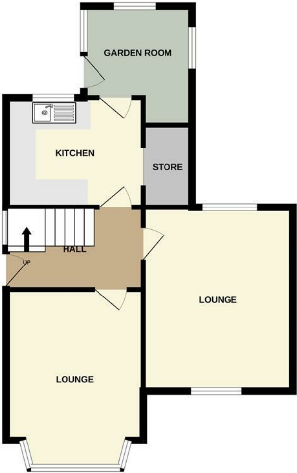
GROUND FLOOR 571 sq.ft. (53.0 sq.m.) approx.